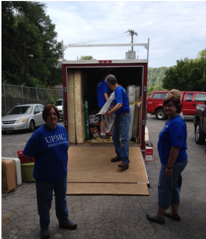
First Presbyterian and United Methodist group deliver donations

The First Presbyterian Church of Irwin and the Community United Methodist Church sit only five minutes away from each other in Irwin, Pennsylvania. United in their