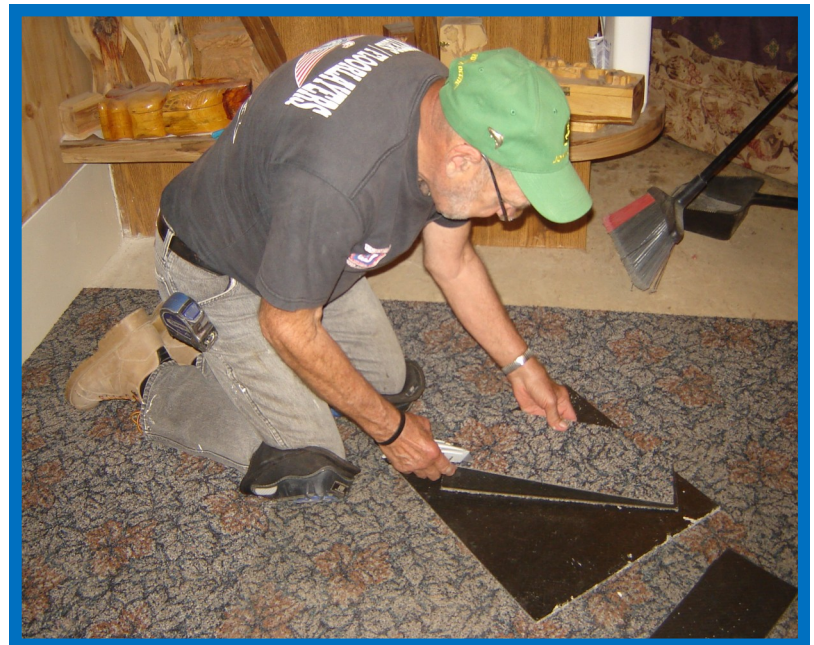
CARPET IS LAYED IN HOME DAMAGED BY FLOOD WATERS

Long term recovery needs vary from home repair and furniture replacement to emotional support. Whatever the need, WV VOAD member agencies, donations and volunteers can make the recovery for these families easier. Look for all volunteer photos from this year and learn more about volunteering with WV VOAD by following this link: www.wvvoad.org .