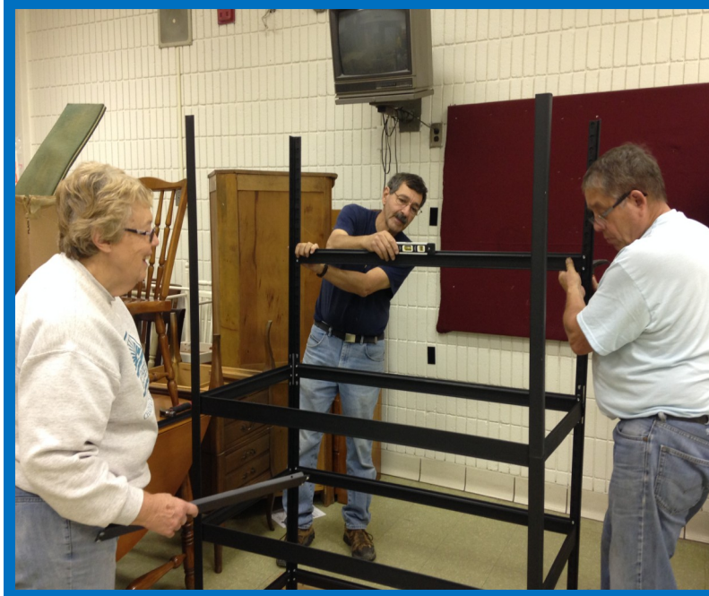
MEMBERS OF THE RICHFIELD UCC TEAM CONSTRUCT SHELVING FOR THE WAREHOUSE

Members of the Richfield United Church of Christ in Richfield, Ohio also volunteered with the Mingo County Long Term Recovery in October. The team laid flooring, hung new sheetrock and replaced trim in two homes that suffered flooding in March. The Richfield team also donated and constructed shelving for the Southern West Virginia Disaster Center warehouse where a collaboration of flood buckets, supplies and furniture from United Church of Christ, United Methodist, Church of Christ Disaster Relief, Church World Service and Appalachian Outreach are stored.