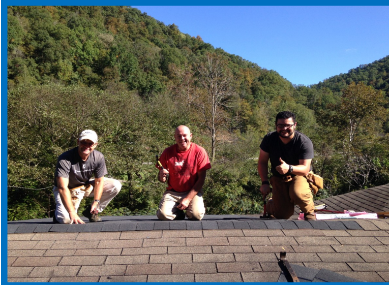
THE TROUTMAN BAPTIST TEAM REPLACE SHINGLES FOR A FAMILY IN MINGO COUNTY

Damaged roofs, moldy sheetrock, soaked floors and destroyed electrical systems. How do the members of WV VOAD reach all of the WV families who face these concerns after a disaster? By making the 4 C's: Cooperation, Communication, Collaboration and Coordination the focus of our response and recovery! WV VOAD and Long Term Recovery Groups continue to coordinate materials and volunteer teams to repair homes damaged all over WV by severe storms and flooding earlier this year.