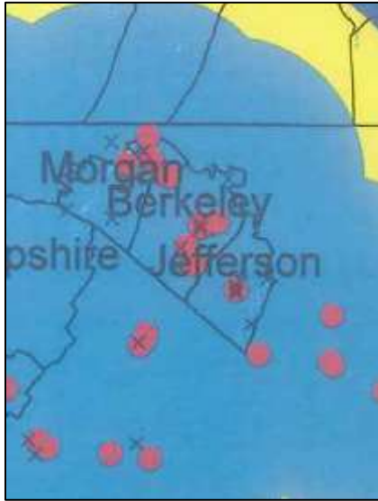
Figure 1: THP PCPs near Berkeley