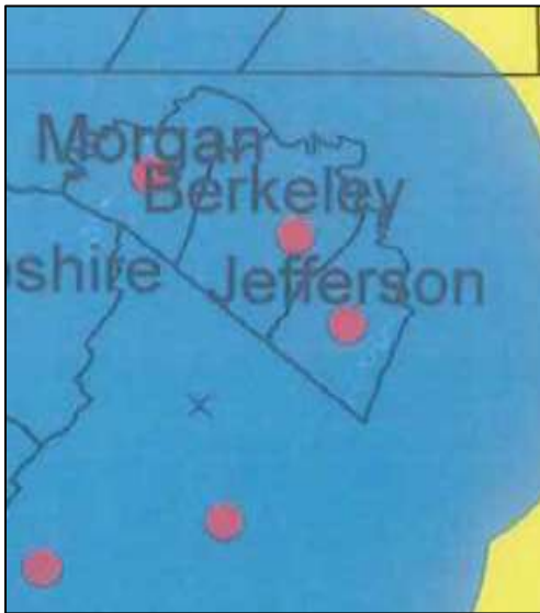
Figure 5: THP Hospitals near Berkeley