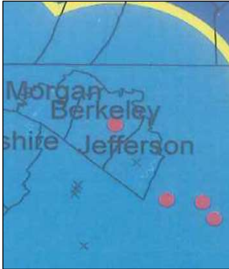
Figure 3: THP OB/GYNs near Berkeley