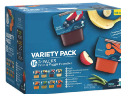
16 pack of 4 oz double packs (128 oz box)