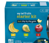
6 pack of 2 oz containers starter kit (12 oz box)