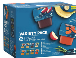
16 pack of 4 oz double packs (128 oz box)