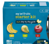
6 pack of 2 oz containers starter kit (12 oz box)