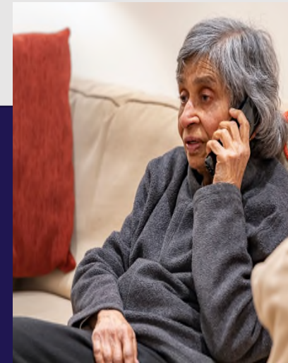
INBOUND PHONE INTERVIEW

A traditional survey mailed to your home