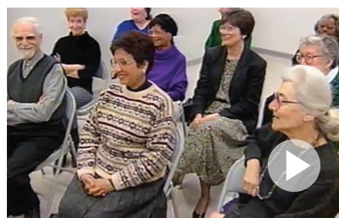
Alcohol and medication among older adults

Link 2: https://www.youtube.com/watch?v=FQan4-6amJk