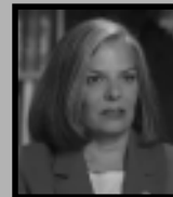
Julie Gerberding SARS