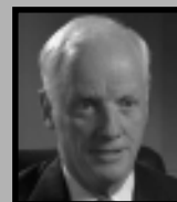
Frank Keating OK City Bombing