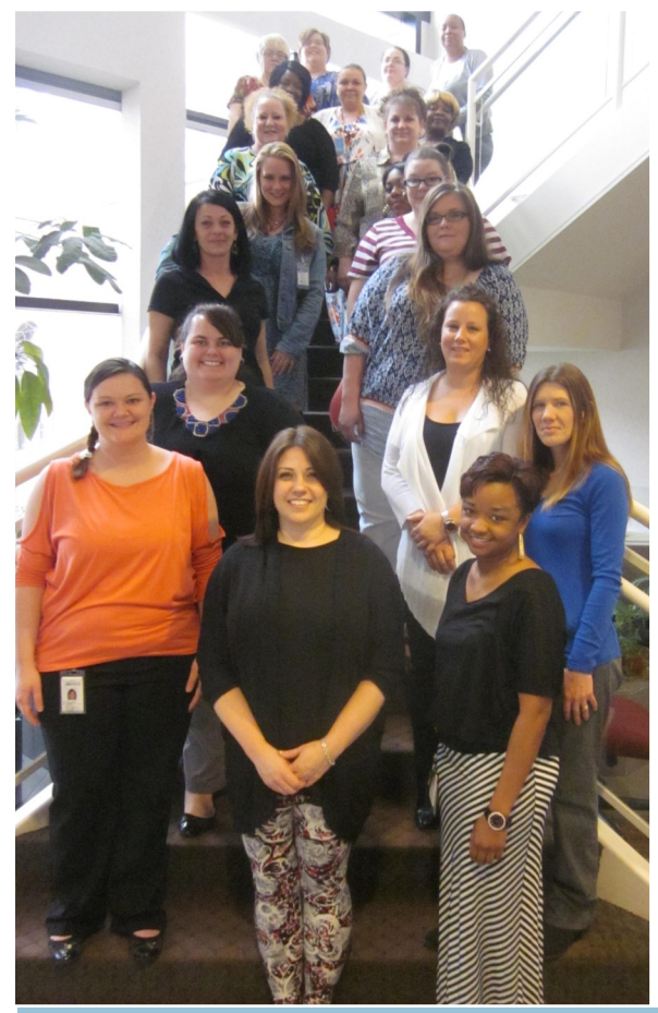
Molina Medicaid Solutions Provider Enrolment Team

The Department has already revalidated more than 20,000 enrolled Medicaid and WVCHIP providers. Although they have more changes heading their way, they are ready to provide the upmost customer service to